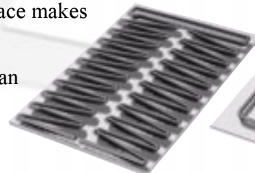
Digital Knight SuperCoil-Microwinding™ heat platen